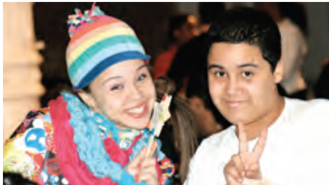
Family Center youth enjoying arts & crafts.

As always, our volunteers had a large hand in making the event such a success. Volunteer teams from Credit Suisse, Lehman Brothers, MAC and the Volunteer Referral Center helped our children with arts and crafts, served food, and took family portraits. In addition to these volunteer teams, we had a number of individuals helping out at the party, for total of 137 volunteers. Even Santa Claus stopped by the party with one of his elves to take some pictures and wish a Happy Holidays to everyone in attendance.