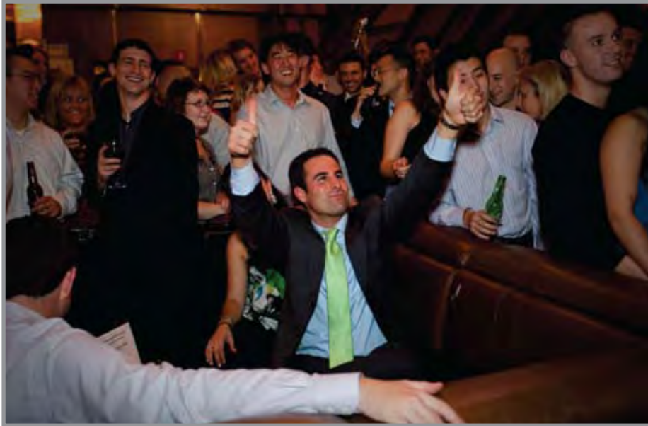
Bids for Kids Auction winner celebrates.

The Junior Board hosted its 7th annual fundraiser, BLOOM, at the Union Square Ballroom on May 7th. Planning the 2009 event was challenging due to the economic climate, but TFC Junior Board rallied to make the BLOOM evening a blossoming success. The silent auction featured some superlative items, including ten Yankees ticket packages, generously donated by our friends at Robin Hood, which alone helped us raise almost $7,000. Thanks to the dedicated efforts of the Junior Board and TFC staff, BLOOM 2009 raised over $50,000 in needed funds for our work with families.