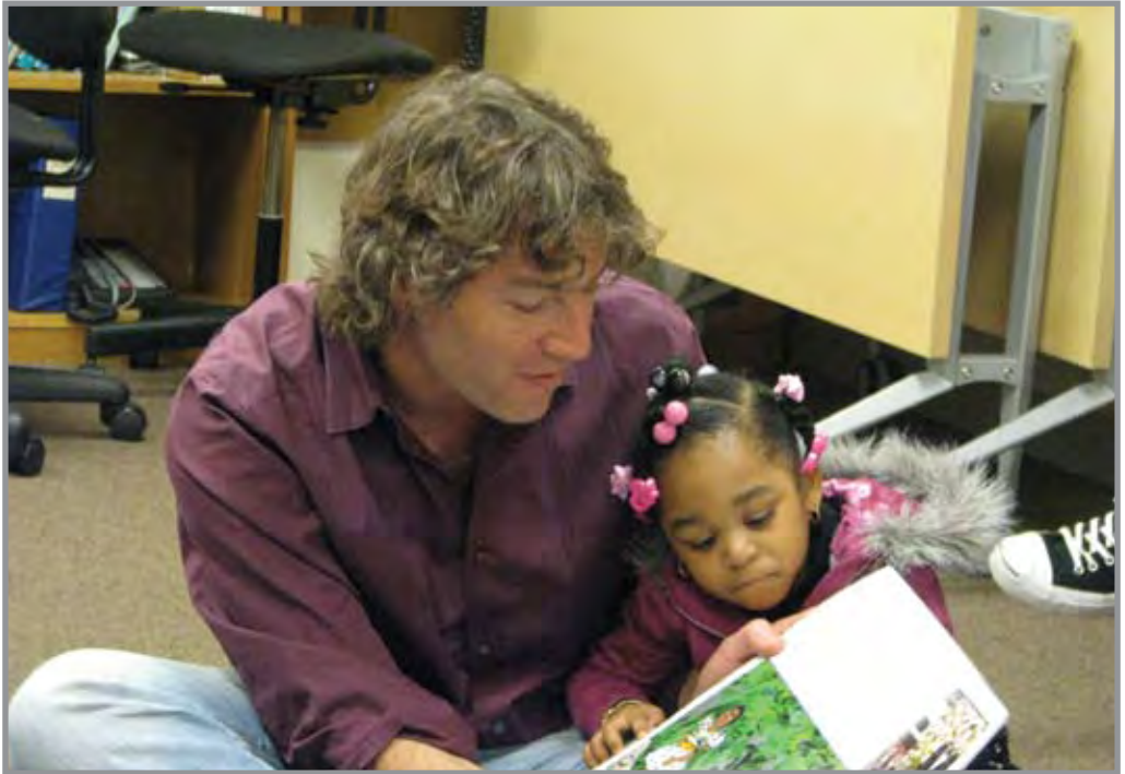
Google volunteer reading to one of our children

and its employee volunteers. Over the next year, we plan to redesign The Family Center's website to become a living information resource for client families and those interested in our work. We are committed to using online tools and new media to further our mission, and are deeply grateful to our friends at Google for the important part they play in showing us the way.